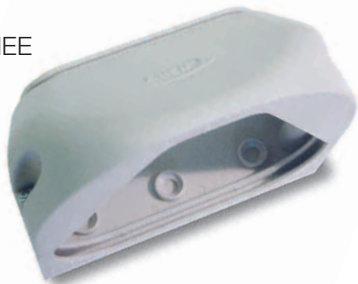
Adaptor Trough NEE Height 75.5mm Width 86mm Depth 93mm