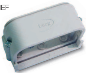
Mini Extension Trough NEF Height 33.5mm Width 79mm Depth 65.5mm