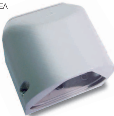
Extension Trough NEA Height 90mm Width 89.5mm Depth 93mm