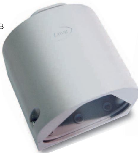
Extension Trough NEB Height 60mm Width 89.5mm Depth 93mm Note: Available as part of the extended long trough - Ref NEC in the ordering chart