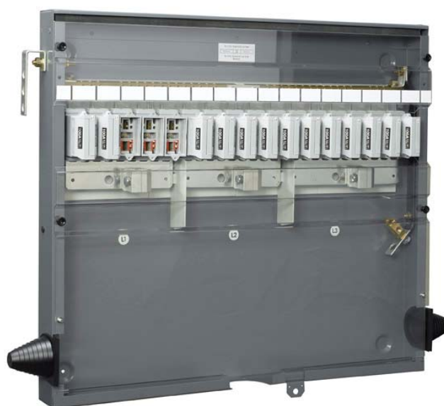
16 way version with cover removed