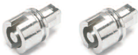
Examples of anti-vandal locks available from Lucy Lighting

This is an optional extra for the Heritage Range Feeder Pillar.